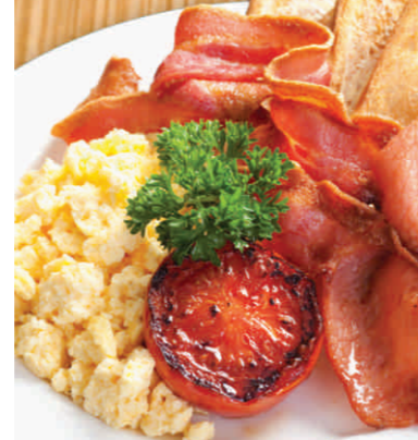
Classic bacon, eggs, tomato & toast