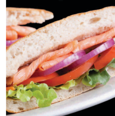
Smoked salmon gourmet sandwich