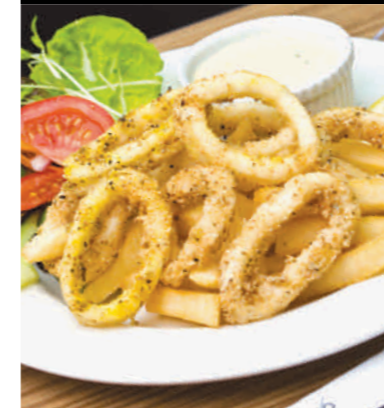
Lemon pepper calamari & chips