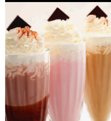
Iced chocolate, strawberry or coffee