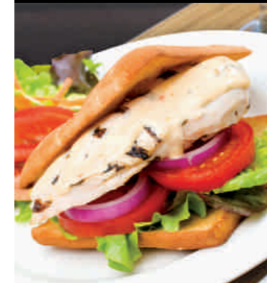
Lifestyle chicken fillet burger