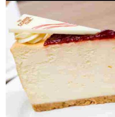
The Coffee Club raspberry cheesecake