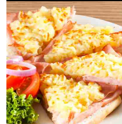
Ham and pineapple open grill