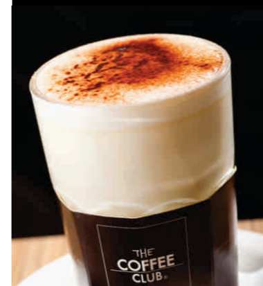
White hot chocolate