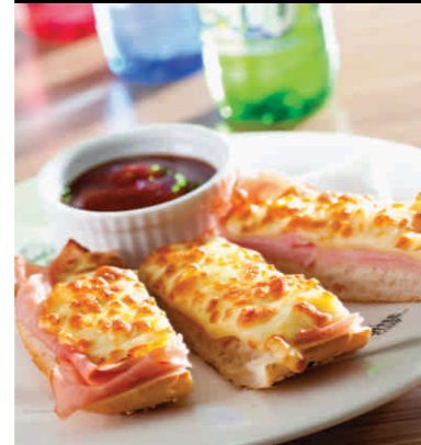
Kid's ham and cheese fingers