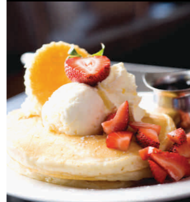
Pancakes with ice-cream & strawberries