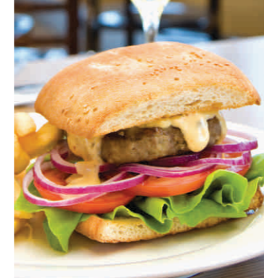
Gourmet beef burger

Look out for this symbol for our vegetarian meals.