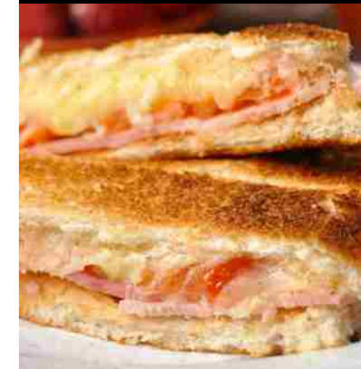
Ham, cheese & tomato toastie