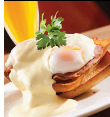
Eggs benedict with bacon