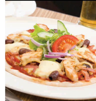
The Coffee Club Pizza