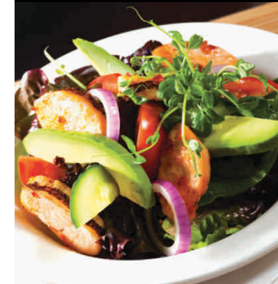
Citrus chicken salad