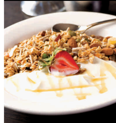
Fruit & nut muesli with yoghurt & honey